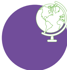
LANGUAGE: ARABIC/FRENCH/ENGLISH ETC.