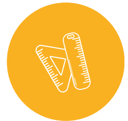
MATH BOOT CAMP